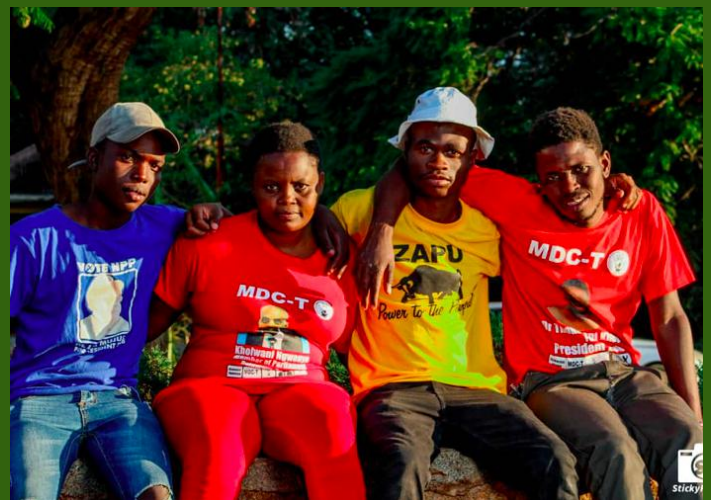
Youths from different political parties posing for a picture at the YETT multi-party dialogue

The dialogue also sought to share information on youth challenges and opportunities in political participation; devise a collaborative strategy for pushing youth issues; and to develop strategies for increasing influence of youth structures in the political parties. It attracted over 20 youth leaders from different political parties like Movement for Democratic Change-T (MDC T), MDC A, Zimbabwe African People's Union (ZAPU), National People's Party (NPP). Through its work, YETT continues to promote the development of a culture of dialogue among (youth-youth), (youth and duty bearers) (youth and policy makers) and (intergeneration) dialogue to better influence the country's political and social leadership. The Multi-party dialogue enhanced the youth leader's understanding of current youth issues and opportunities that political parties need to address. It also enhanced capacities of youth party representatives to articulate, effectively communicate and persuasively argue issues that affect them as active individuals and engaged citizens.