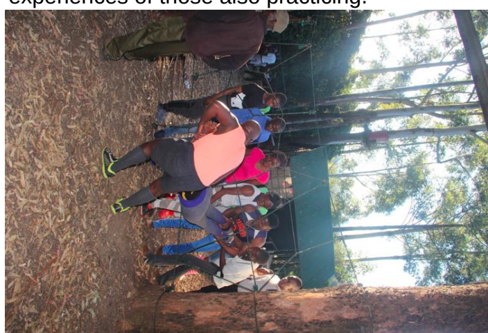
2019 Winter School during team building

The second and final week saw the participants convening back in Harare for the practical sessions of the course focusing on Leadership in Practice. The Leadership in Practice practical sessions drew facilitators practicing from different sectors to educate the participants for the most part. They also involved an externship in which participants for a full working day got attached to organisations to be fully immersed in practice. This afforded an opportunity to learn through practice, and by drawing from experiences of those also practicing.